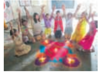
Festival celebrations at Phoolwari Schools. From left to right: Ravana at Dussehra celebrations at Phoolwari School, Ashiana Umang, Jaipur; rangoli patterns and diyas for Diwali by Phoolwari kids of Ashiana Town, Bhiwadi