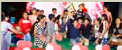
Children enjoy making new friends at the Know Your Neighbour meet

A Know your Neighbour gathering at Ashiana Anantara, Jamshedpur drew nearly 500 neighbours who mingled with each other over tea and fun filled games.