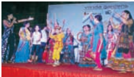
Dandiya performance on stage at Vrinda Gardens, Jaipur

At Vrinda Gardens, Jaipur customers and families enjoyed the energetic musical evening. Customers were delighted by the