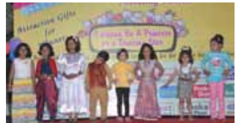
Children at the Barbie 2 event for shoppers at the Village Centre, Bhiwadi

A Barbie -2 Event at the Village Centre, Bhiwadi was organised by Maintenance Services to attract shoppers. Little kids and adults participated in a ramp show and other fun activities. The event was appreciated by both shoppers and shopkeepers.