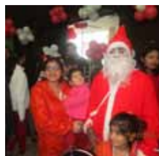
Christmas celebrations at Greenwood and Rangoli Gardens, Jaipur