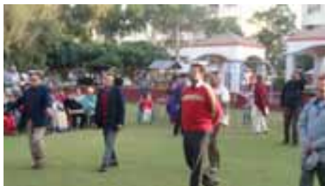
Ashiana Utsav Bhiwadi: Men participating in a Balancing and Walking competition