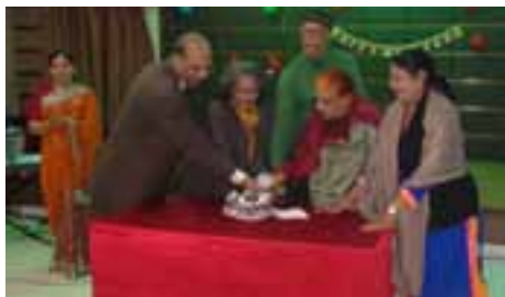
At the month end party in Utsav, Bhiwadi