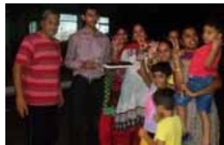
Several groups of ladies competed in the rangoli competition at Ashiana Shubham, Chennai; The winners, Group B receiving their prize