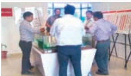
The Bankers Meet at Ashiana Surbhi, Bhiwadi with staffers of Union Bank

Over 350 guests interacted with each other as future neighbours met, mingled and were unanimous in expressing their appreciation of the status and quality of construction as well as the add on facilities like a kids play room, the open lounge area etc. The Kejriwal and Dai show and the great food were a massive hit with everyone.