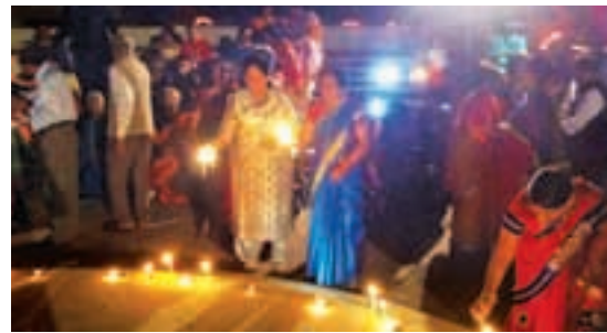
Residents enjoy dancing during Garba & Dandiya Night at Utsav, Bhiwadi; extreme right: Utsav Bhiwadi enjoys Diwali with lamps and candles