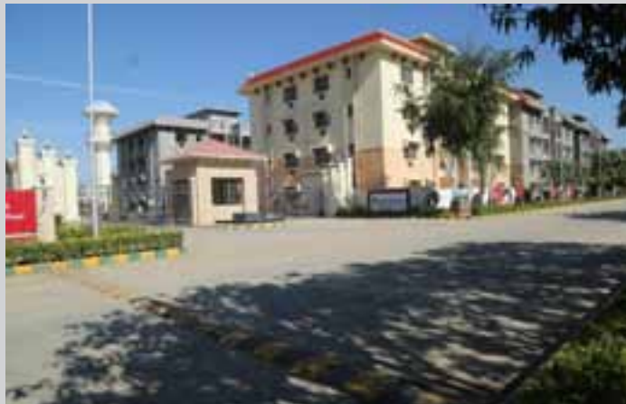
Ashiana Navrang, Halol is in an advanced stage of construction. Left: Club House; right: the main entrance