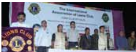
The General Body Meeting of the Lions Club, Halol was held at the Ashiana Navrang site

The Ashiana Dwarka Sales team participated in the Industrial Fair 2015 organised by Laghu Udyog Bharti.