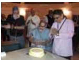
Utsav Lavasa residents enjoy themselves at every month end party