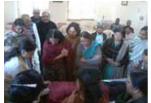
Utsav Jaipur residents are keen observers at the acupressure demonstration

Tambola is among the more popular activities at almost all Ashiana projects. At Ashiana Utsav, Jaipur tambola sessions are organised twice a month and are extremely well attended. At Ashiana Utsav, Lavasa too, residents enjoy the