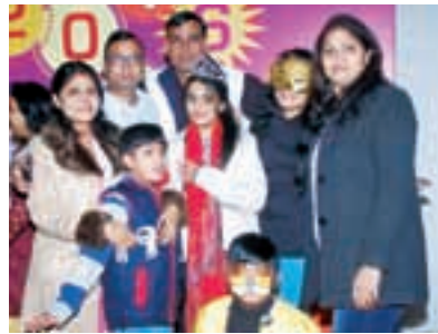
New Year & Christmas celebrations: Kids onstage for a dance at Gulmohar Gardens; At the selfie zone, families pose for that perfect shot at at Gulmohar Gardens, Jaipur