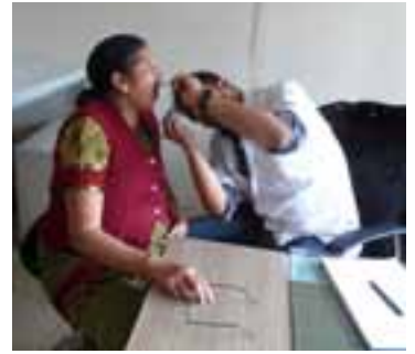
Jaipur Utsavites availed of (left to right): a Diabetic Awareness Camp; a specialised Eye Camp and consultations during the Dental Camp