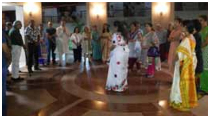
Ashiana Utsav, Lavasa residents get together to celebrate the Festival of Lights and share their joy and happiness