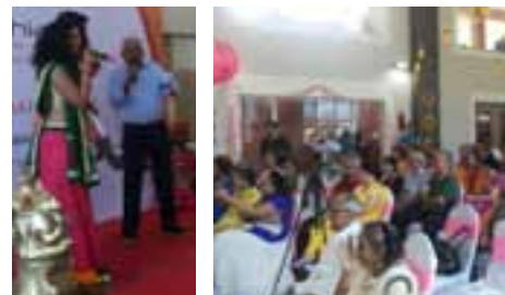
Club House inauguration at Utsav Lavasa