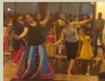
Residents of Ashiana Shubham, Chennai at the club house enjoying music at their DJ night

together and share experiences of the active lifestyle at Utsav.