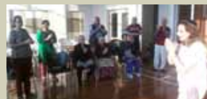
Laughter Evening at Lavasa