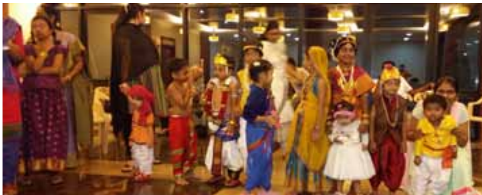
Children in Fancy Dress waiting to playact and enjoy the fun and games at Chennai