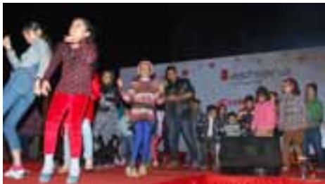
New Year joy with children, song and dance at Ashiana Umang, Jaipur