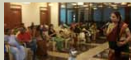
At the well-attended fashion show at Ashiana Shubham, Chennai.