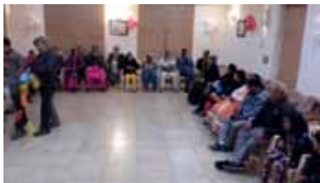
Utsav Jaipur – Balloon distribution for the Bursting the Balloon game.

golf and tambola on offer as well. After a fun session of golf which no one had played before, a round of tambola was followed by lunch at Utsav Café, Bhiwadi to wind up an enjoyable and exciting Sunday.