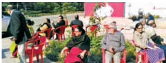
Strategy over tea and snacks during the Treasure Hunt; Customers enjoy musical chairs at a Neighbours Meet in Ashiana Nirmay, Bhiwadi