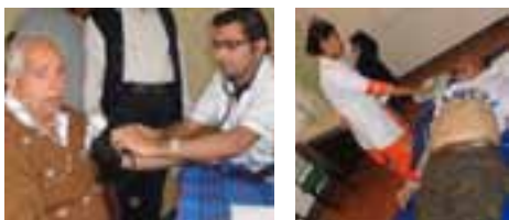
Residents availed the facility of BP checkups as well ECG reports