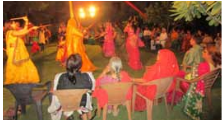
Dandiya Night celebrations (clockwise): at Greenwood, Ashiana Manglam, Jaipur; Rangoli Gardens, Jaipur; and Ashiana Amarbagh, Jodhpur

was widespread across Ashiana projects with community halls and clubhouses booked at Ashiana Amarbagh, Ashiana Mangalam, Ashiana Greenwood and Rangoli Gardens, Jaipur to celebrate X'mas. There was Santa Claus at each gathering of course with presents, cakes, sweets and chocolates for everyone. Different venues had organised their own unique blend of fun and frolic with group dances, competitions, DJs, puppet shows and Christmas songs.