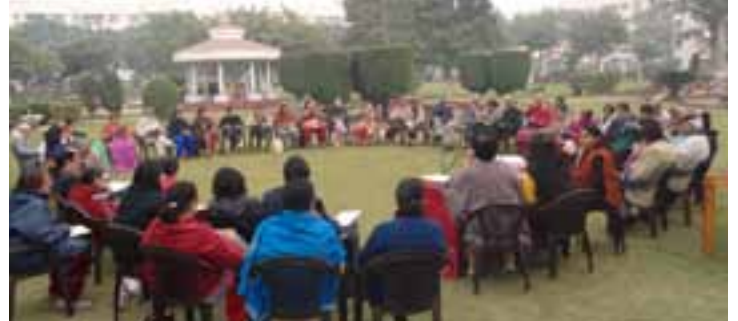
Tambola is a popular activity at Ashiana projects. Left to right: Ashiana Utsav, Lavasa and Ashiana Utsav Bhiwadi residents enjoying tambola