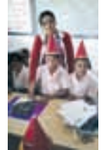
From left: Upgradation of Government School at Ghatal, Bhiwadi; Christmas at Phoolwari Schools: Ashiana Town, Bhiwadi and Ashiana Navrang, Halol