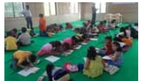
An all Ashiana Sit & Draw competition: Participants and winners (from left to right) at Ashiana Greenhill, Neemrana; Ashiana Woodlands and Ashiana Brahmananda, Jamshedpur; and at Ashiana Amarbagh, Jodhpur