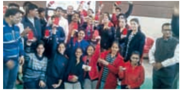
From left: Ladies with their beautiful mehendi patterns at Ashiana Gardens, Jamshedpur; at the Inter Ashiana Quiz competition at Bhiwadi; winners celebrate after the Inter-Ashiana Badminton tournament at Ashiana Aangan, Bhiwadi