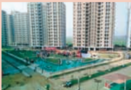
Above: Main entrance at Ashiana Town Bhiwadi; left: The beautiful water body shaped in a Falling Leaf theme

The development work of Phase I has reached its final stages. The construction of the water body is complete and has enhanced the beautiful landscaping of Ashiana Town, Bhiwadi .