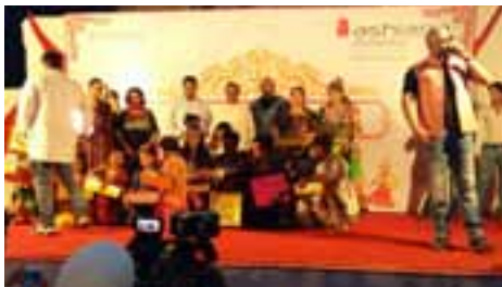
Prize winners at the Dandiya Night pose for a group photograph at Dwarka, Jodhpur