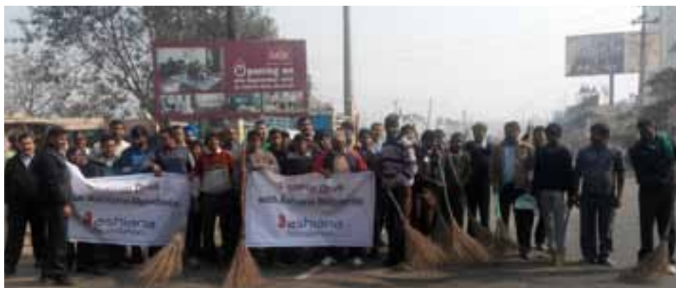
Cleaning up the road from Bhagat Singh Colony to Ashiana Village