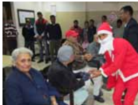
Jingle all the way with Santa Claus

happy to see these children and enjoy time with them. Children recited poems, sang songs and danced to bollywood music leaving the residents wanting more.