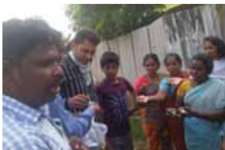
Giving medicine to the flood affected, Chennai

Customers were keen participants at a treasure hunt organised at Ashiana