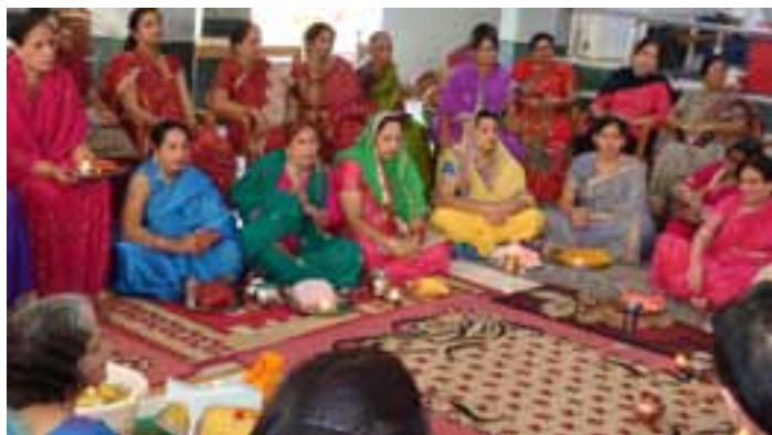
Ladies observing Karwa Chauth puja at Bhiwadi