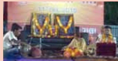
Sundarkand Path was organised at Ashiana Navrang, Halol

The event was organised to promote the EMI sharing scheme. Accompanying children had fun playing a carrom board competition.