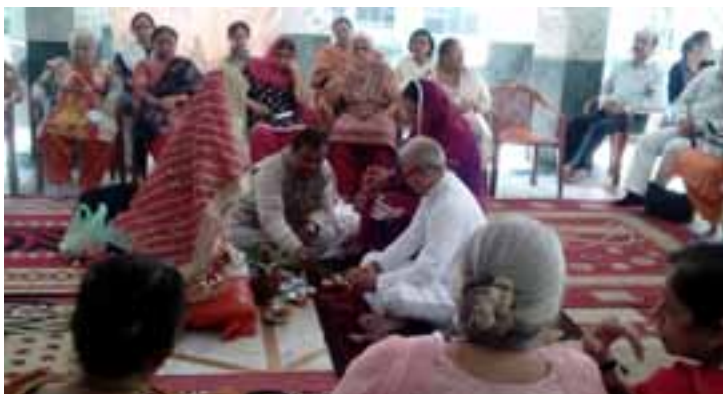
Bhiwadi Utsavites at the Utsav Temple for Tulsi Vivah

Tulsi Vivah was celebrated at the Utsav Temple by Bhiwadi Utsavites with bhajan kirtan followed by bhog and aarti. A bhandara was held in the Utsav Hall.