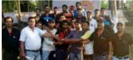
Inter Ashiana Cricket Runners Up Brahmananda with the Ashiana Trophy

Four teams – from Ashiana Residency Greens, Ashiana Woodlands, Ashiana Gardens and Ashiana Brahmananda – made up the challengers for the Inter-Ashiana Cricket Championship organised at Ashiana Residency Greens, Jamshedpur . The champs were Ashiana Gardens with Ashiana Brahmananda as runners-up.