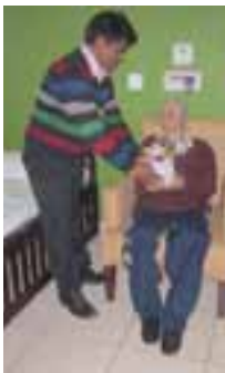
Utsav Care Homes welcomes new residents