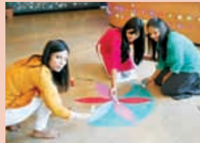
Rangoli decorations by the Bhiwadi branch office on Diwali