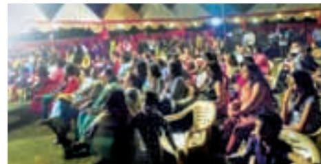
An eager audience is all set for New Year celebrations at Bhiwadi

The Ashiana Greenhill, Neemrana , maintenance team undertook an Old Clothes Collection drive for villagers with the active help of residents and has distributed warm clothes to the needy.