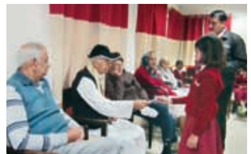
Diwali Celebrations at Care Homes, Bhiwadi; puja at Utsav Care Homes, Jaipur; new physiotherapy equipment; kids time at Ashiana Bhiwadi