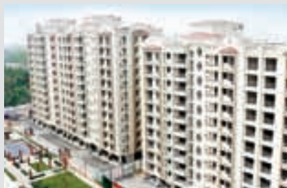
Phases Leo and Orient are getting ready for a timely handing over

Twenty residents have already moved in and are residing in this project and enjoying the facility. Phase Leo and Orient are also on schedule for a timely handing over. Construction work for Aries is also in full swing.