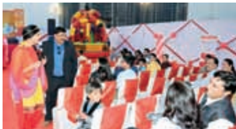
The Customer Meet at Ashiana Tarang, Bhiwadi was a great success

A free registration camp was setup at Ashiana Town, Bhiwadi to help labour get their identity proof and contribute towards the initiatives taken by Indian government.